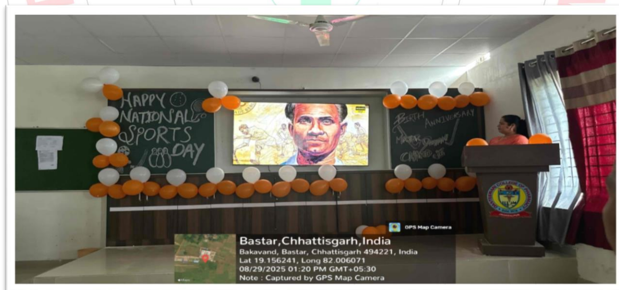
Figure 3 Documentary on Major Dhyhan Chand Ji

The day's events formally commenced at 1:00 PM with a solemn opening ceremony. The program began with an inaugural address, emphasizing the importance of sports in a student's holistic development. This was followed by the screening of a documentary on the life and achievements of Major Dhyhan Chand, providing an inspiring tribute to the "Wizard of Hockey."