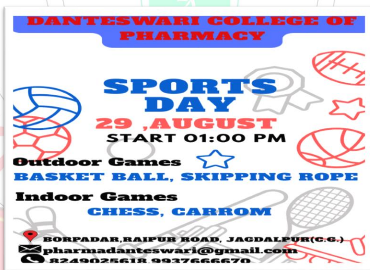
Figure 1 Poster Shared in College groups

In alignment with the directive from the Chhattisgarh Swami Vivekanand Technical University (CSVТУ), Danteswari College of Pharmacy successfully organized its annual Sports Day on August 29, 2025. The event was a vibrant celebration of National Sports Day, honoring the birth anniversary of Major Dhyan Chand, the legendary hockey player. The day's activities were designed to promote physical fitness, teamwork, and a spirit of sportsmanship among the students. The event's schedule and details were communicated to students via an official notice.